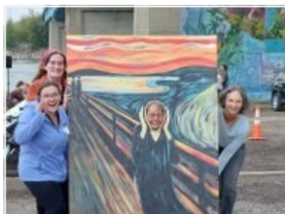
Our group, pictured with the new community mural.

Community contributions totaled 511 hours for 15 events. These included activities such as Meals on Wheels, Adopt a School program, The Banquet, the Community mural, a float in the July 4 th and Autumnfest parades, and much more.